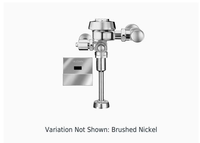
Variation Not Shown: Brushed Nickel