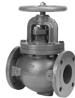
F-738-31 Flanged-Raised Face

2 2" thru 6" have Bronze ASTM B584 Disc. 8" thru 10" have Ductile Iron Disc with Bronze ASTM B584 Disc Face Rings and Brass Pilots.