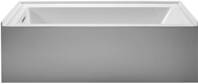
Features integral skirting and tile flange.