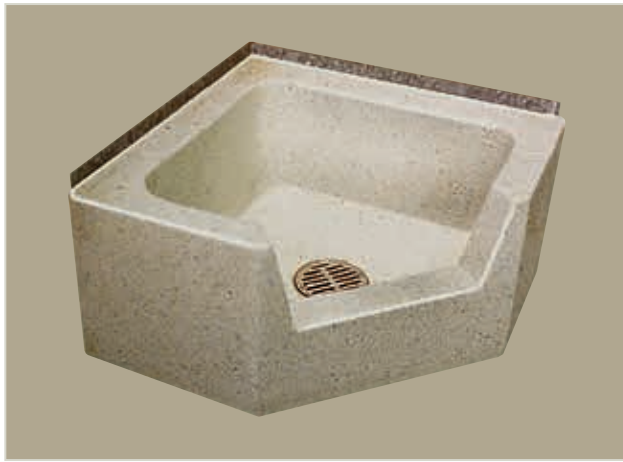
Shown: Model 95